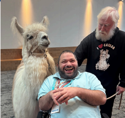
Exhibit Hall Grand Opening Coffee Break - Inquire for pricing

Kick off the exhibit hall with a warm welcome and an energizing start! The Exhibit Hall Grand Opening Coffee break invites attendees into the exhibit hall to gather and connect while enjoying their morning coffee and a small snack. This sponsorship offers a prime opportunity to associate your organization with hospitality, connection, and the opening excitement of the conference.